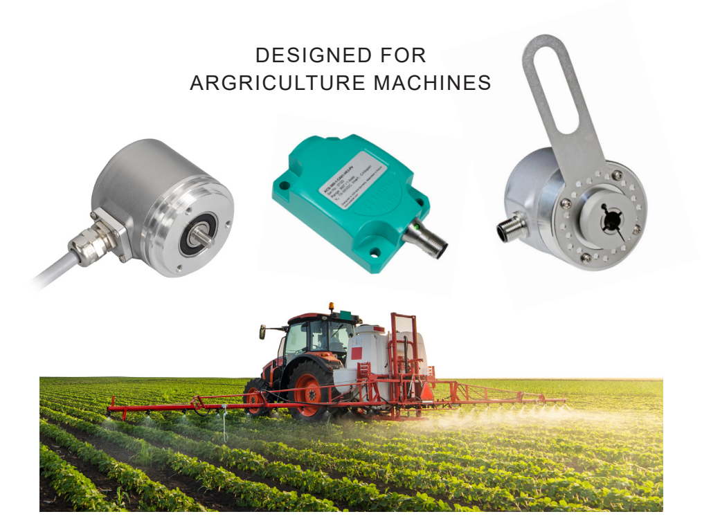
Optimized Speed for Agriculture Machines