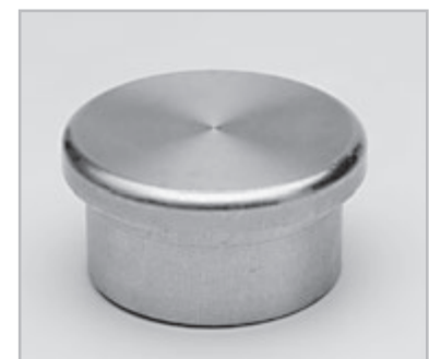
Stopfen Aluminium Tubular endcap aluminium zum Einkleben / to stick in