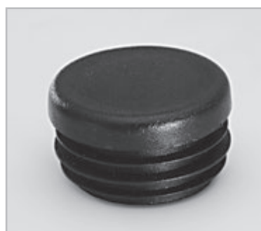
Stopfen, Kunststoff schwarz Tubular endcap, plastic black