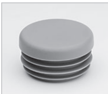
Stopfen, Kunststoff grau Tubular endcap, plastic grey