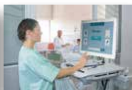
Daily Patient Management