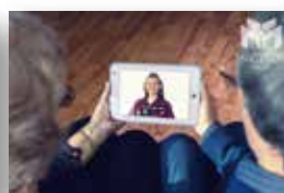
Remote Mobile Medical Service