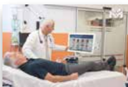
Medical & Healthcare