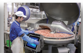
Animal Feed Production